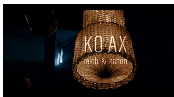
Live recording sessions at Treibhaus Innsbruck (2022)